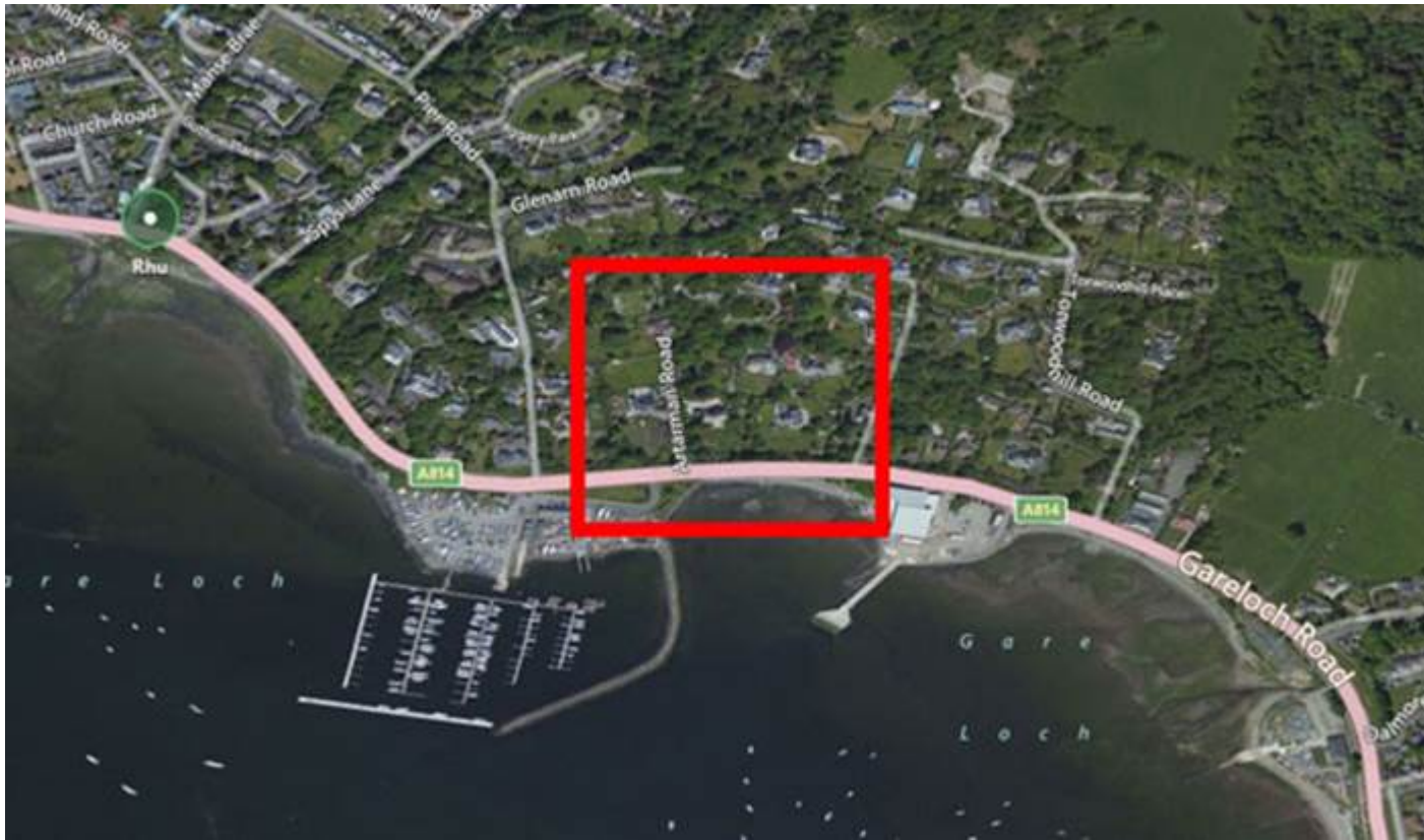
above: area of works at Artarman/Armadale Road