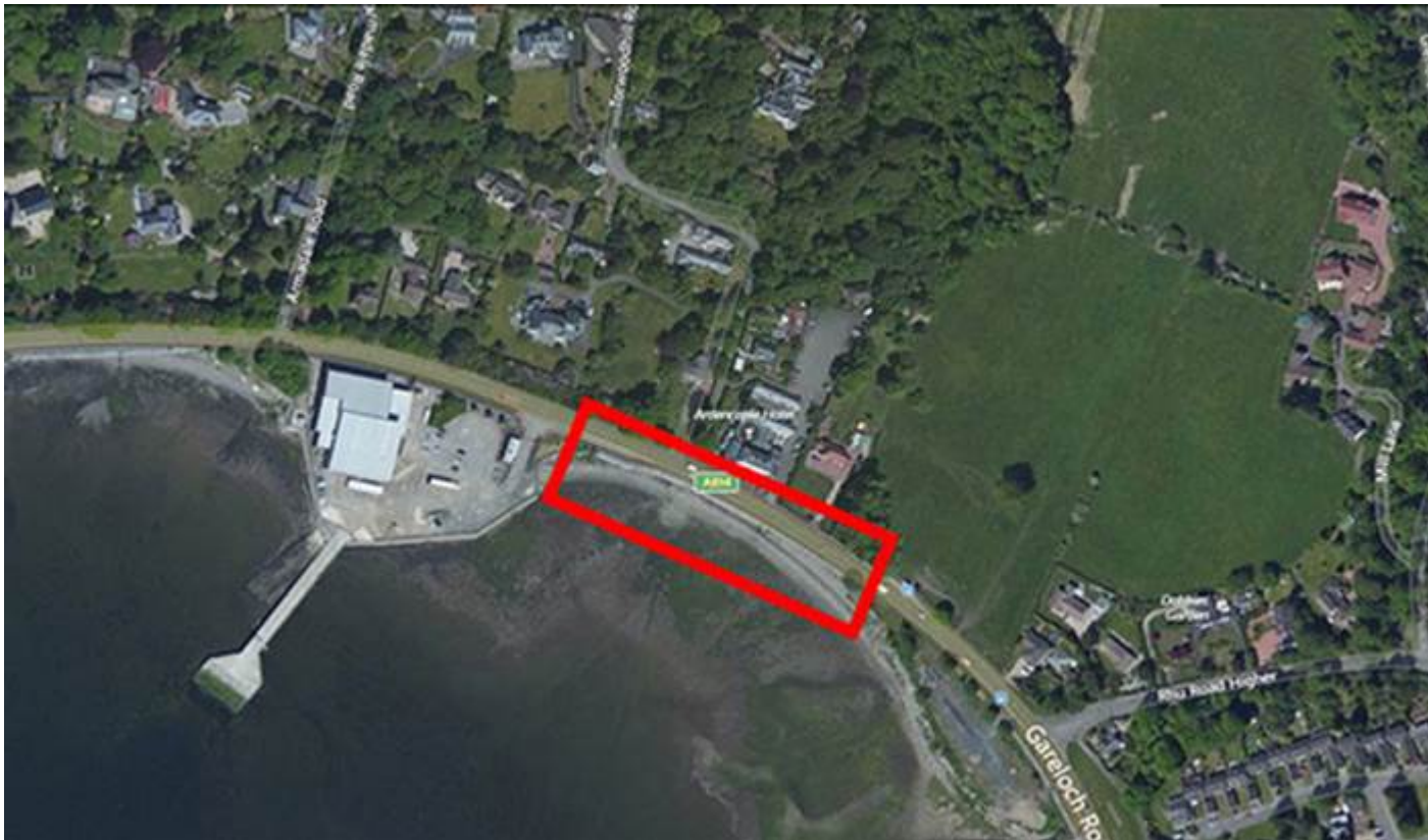
above: area of works at Torwoodhill Road

The image below shows the area of works (represented by the red rectangle). Please note that this is just approximate.